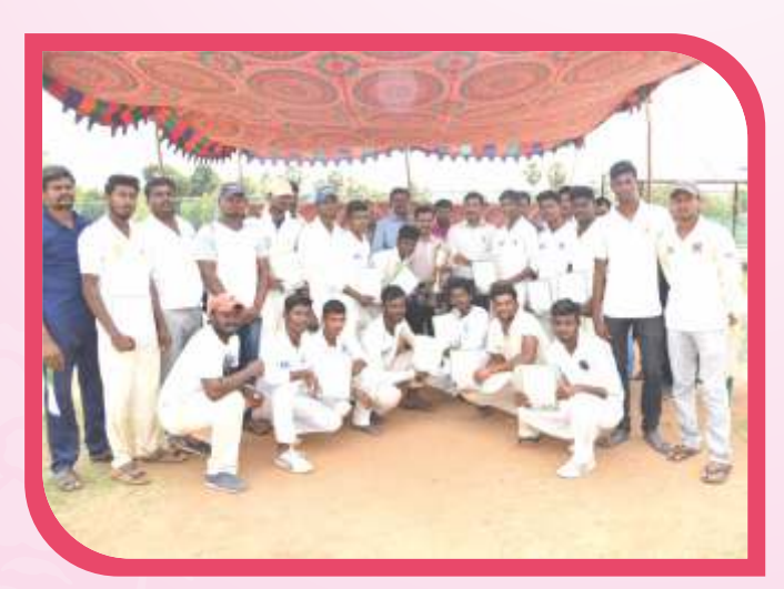
Inter University Cricket finals